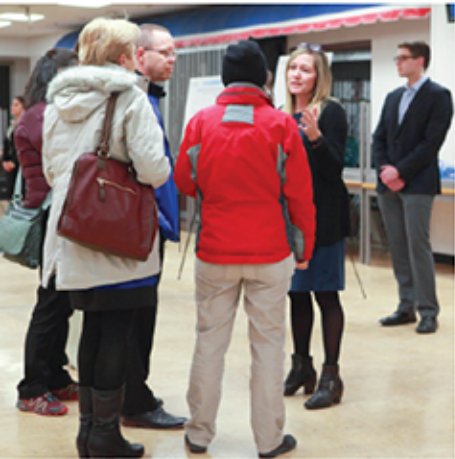
Prairie Sky Planning Meeting – Favorability by Item